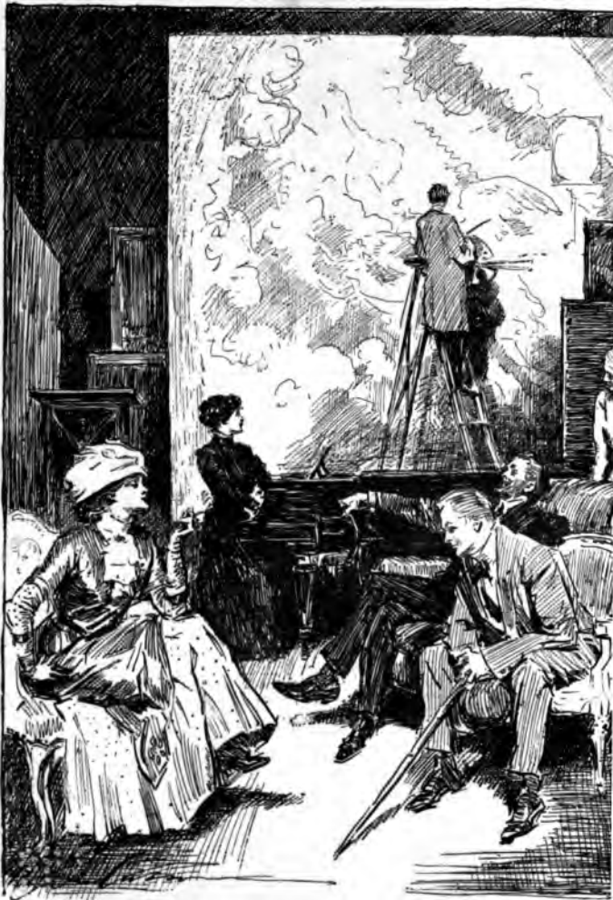
“ She sat at the piano, running her fingers lightly over the keybox [Page 48